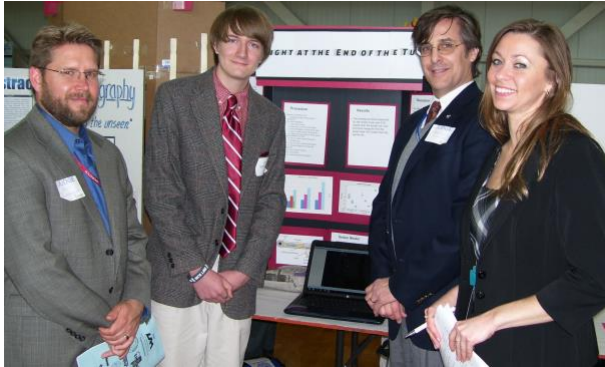
Greater Huntsville Section Judges with Science Fair Entrant

Each year the University of Alabama in Huntsville (UAH) is host to the North Alabama Regional Science and Engineering Fair (NARSEF is generally during the first week in March) and the follow-up Alabama Science and Engineering Fair (ASEF is generally during the first week in April). Both events attract hundreds of people (students, parents, teachers, volunteers), and it is extremely satisfying to be a participant, whether as a student presenting a project or as a professional donating time as a project judge. And judging is an all-day activity. Along with projects being judged in various categories (e.g. elementary division in physical sciences, or junior division in chemistry, or senior division in microbiology) for first, second or third place awards, several professional organizations sponsor special awards that recognize students presenting notable projects in the organization's area of interest. The AIAA is one such organization.